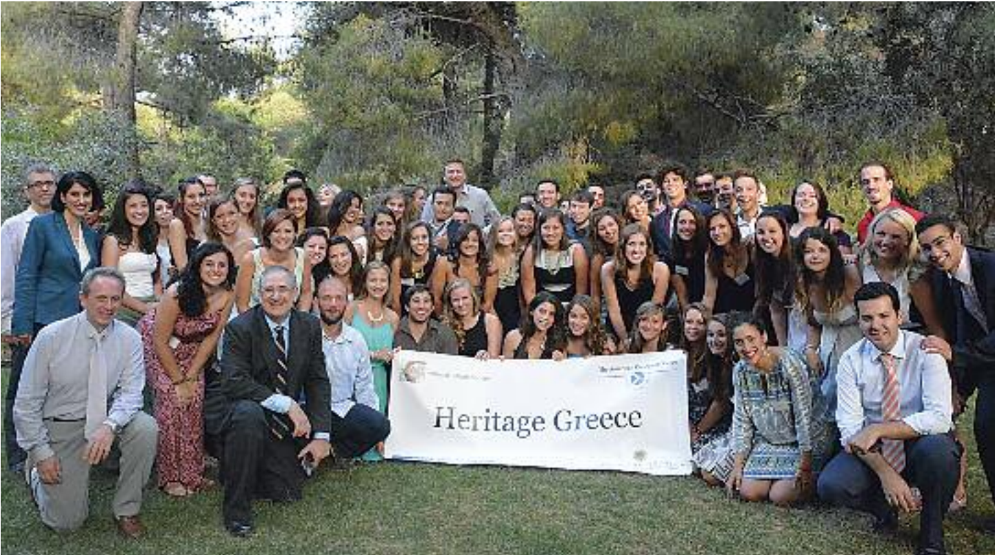
The smiling faces say it all: The National Hellenic Society’s Heritage Greece 2014 was not only a resounding success, but

Passing on the legacy of our "Greekness" to our children and future generations in a world competing for our time is a challenge when viewed within the context of modern demographics and institutions not keeping apace with change. The statistics speak for themselves – the "community" we established will continue to evolve and within the next two or three generations will be unrecognizable. There is nothing permanent, except change, said Heraclitus. Many lament change, while others embrace change as opportunity. Changes within the "community" are no different than those we see in life, especially in the business world. Icons like Kodak, RCA, and Blockbuster, yesterday's industry leaders, are no more. Compared those to Apple and Samsung, companies that embrace and thrive on change and sport a combined market cap over nearly $1 trillion, three times Greece's GDP! NHS looked upon Hellenic heritage with its many nuances, features, and benefits as a product and identified our prospective customers of the same as the next generation of progeny of American families with vary-